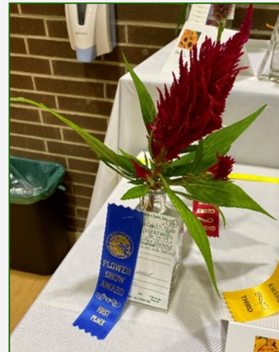
Sara Walker— Celosia pulmosa . One of two blue ribbons out of three entries.