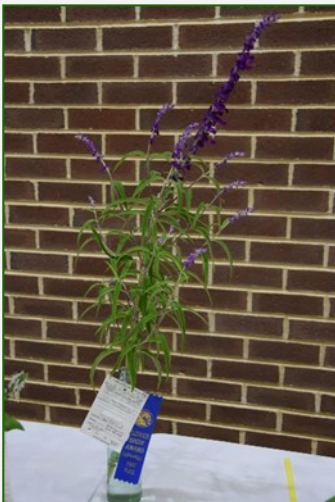
Chloe Pitard— Salvia Lucantia One of two blue ribbon winners out of three entries.