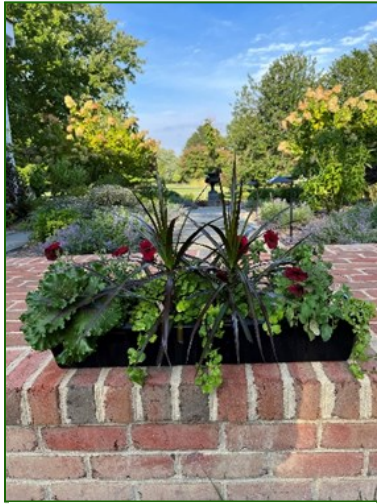
Nicki Schwab—Window Box