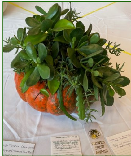
Myra Gons—Her first flower show.