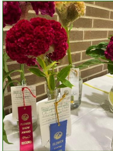
Trish Reynolds— Celosia —One of two blue ribbons out of 16 entries.