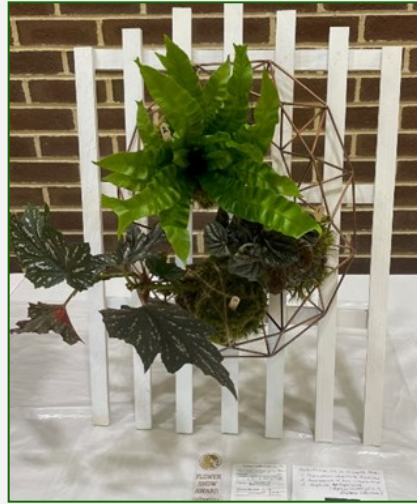
Dede Hoopes—Living Wreath