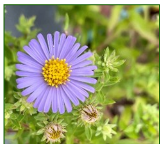
Aster in Trish's garden

So here are a few things to think about as we look at our gardens and decide what can we do to spruce them up for the fall!